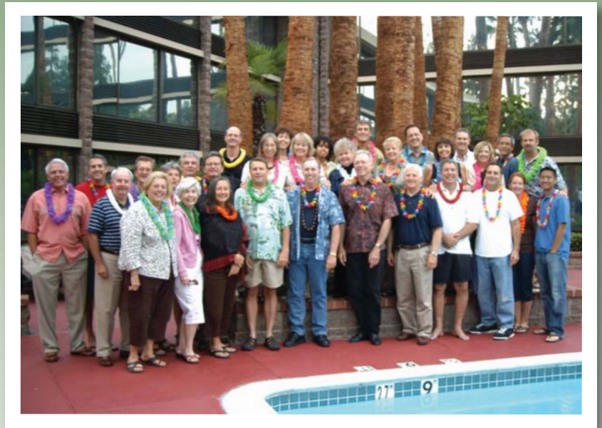
The Development team as our new teammates